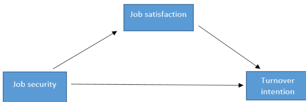
Figure 1. Mediation model effects of Afghan public universities academicians

Figure 1 showed the mediating of Job satisfaction and paths of job security and the turnover intentions of teachers at Afghan public Universities.